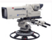
HDC-1000R Multi format HD Studio Camera for Prestige Production